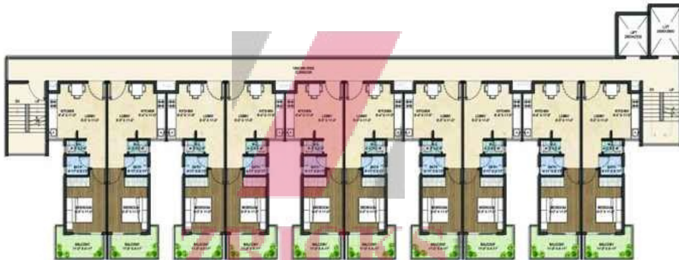
1 BHK CLUSTER PLAN